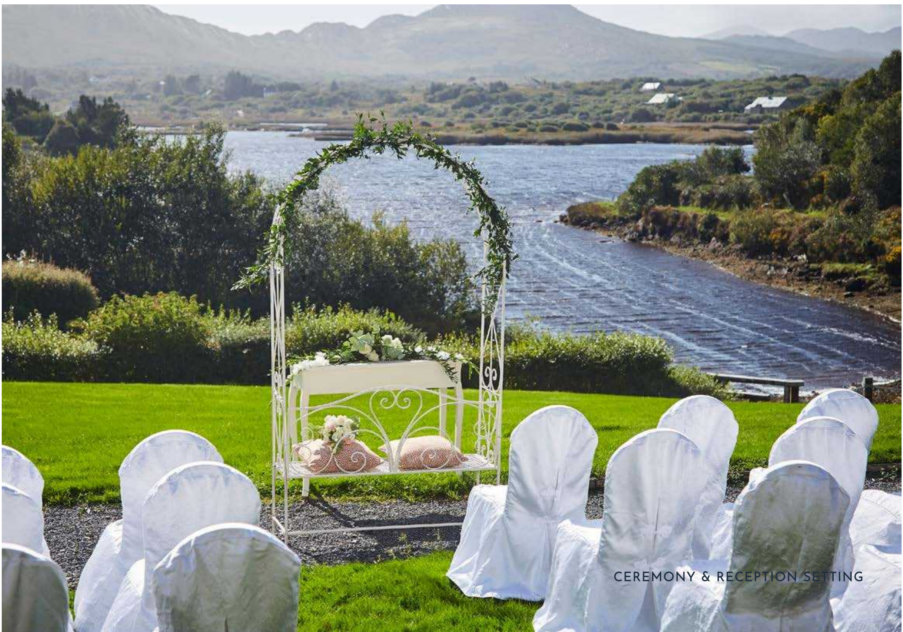
CEREMONY & RECEPTION SETTING